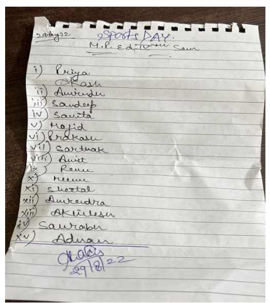
Figure 3 M.P.Ed 4th Sem