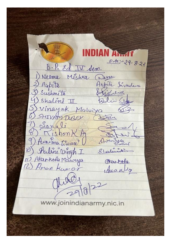
Figure 2 B.P.Ed 4th Sem