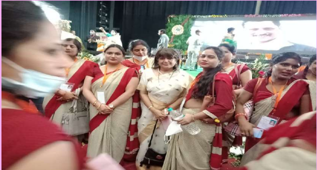
THE INAUGURATION CEREMONY