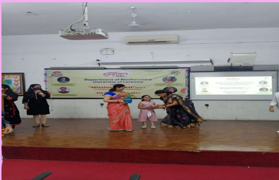
MISSION SHAKTI PHAZE FOUR 22- LAUNCHED BY HON'BLE VICE CHANCELLOR