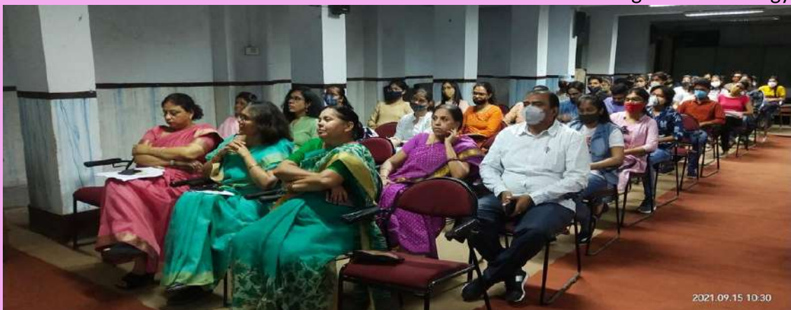
Botony : Medical session