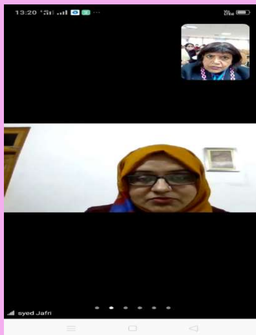
Oriental Studies in Arabic and Persian