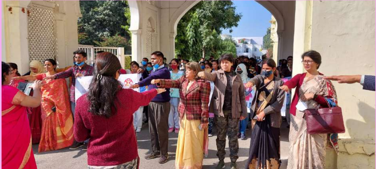
The Campus March