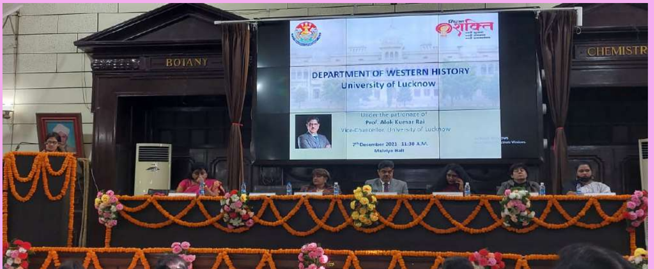
Hon'ble VC as Chief Guest in Mission Shakti program