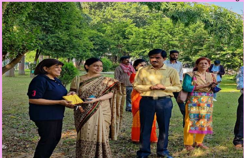
Political Sc: the outdoor activities