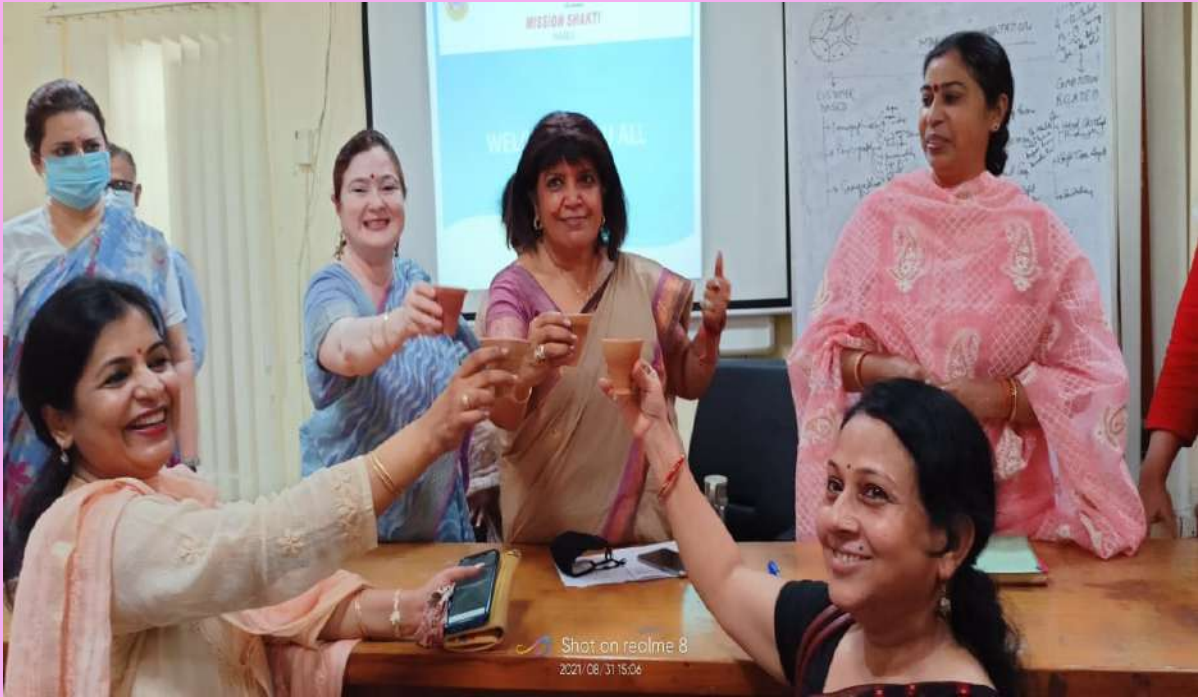
The Mission was always with SHAKTIS