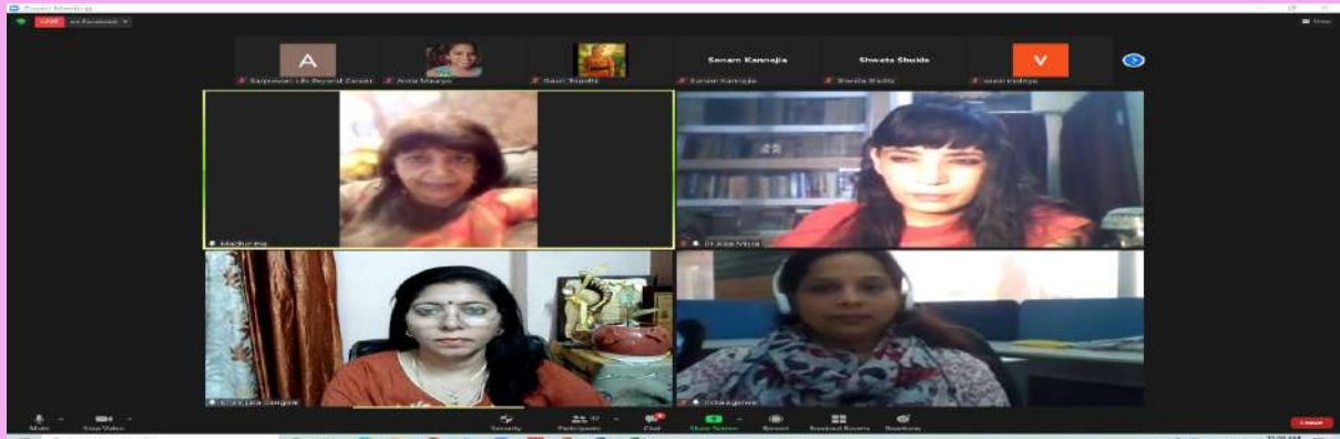
NCC & NSS