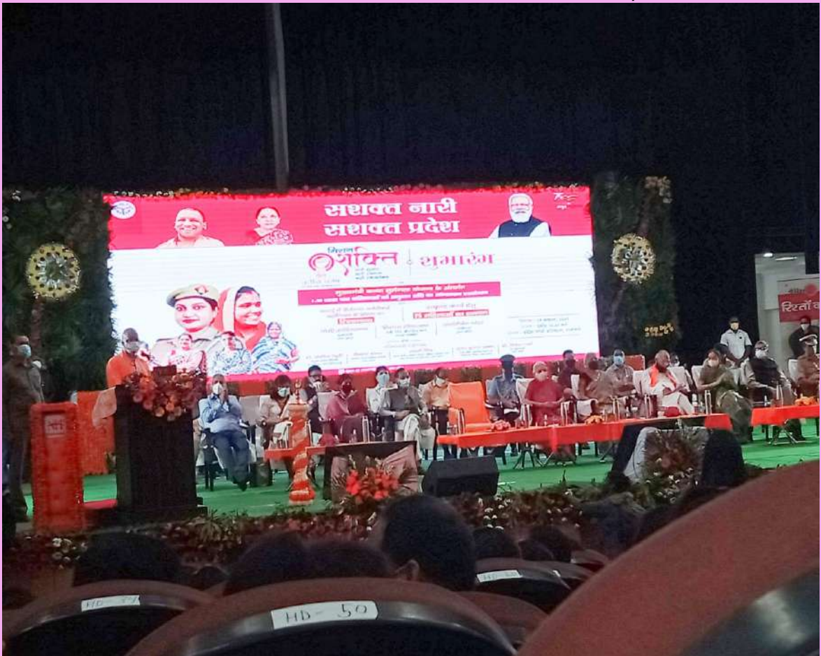
Inauguration by the Hob'ble CM, UP