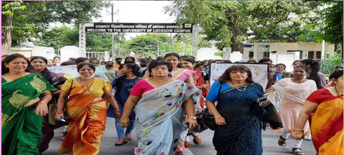
The Mega March Mission Shakti