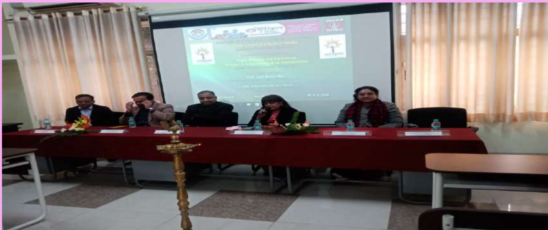
Food Processing and Technology