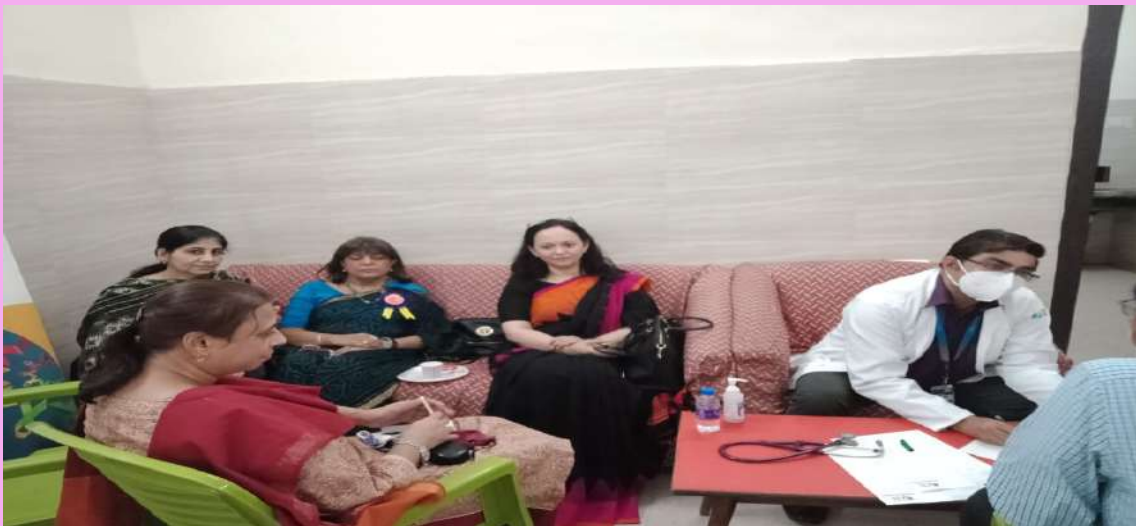
Health Camp and Breast Cancer Awareness