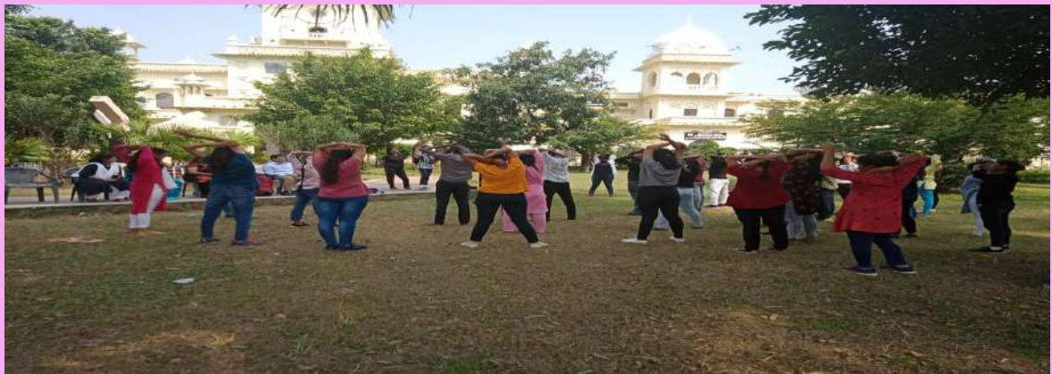
MIH- the Yoga activity and Marital art