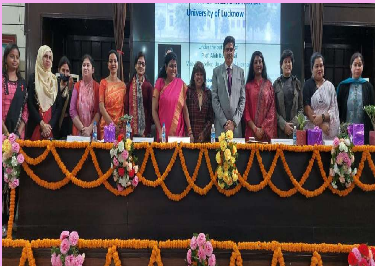
MISSION SHAKTI PHAZE FOUR 23-24 - LAUNCHED BY HON'BLE VICE CHANCELLOR