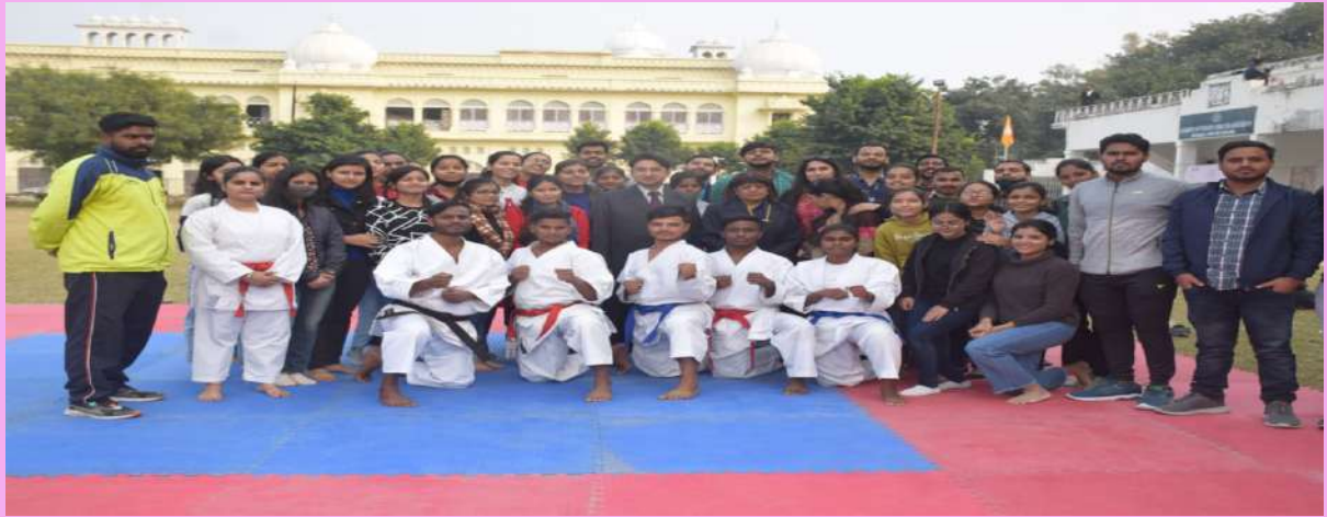
Business Administration: Self Defence and Martial Art