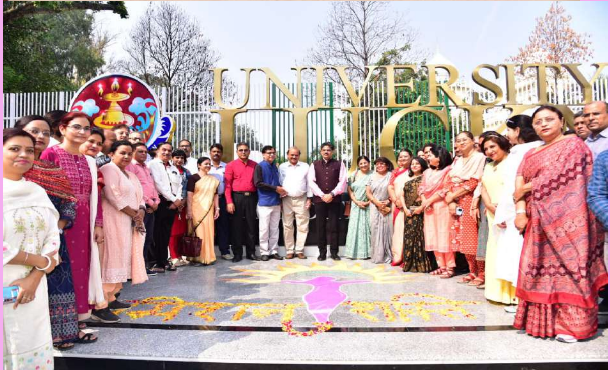
Mission Shakti Phase 4 launched by Hon'ble Vice Chancellor in 2023 at LU