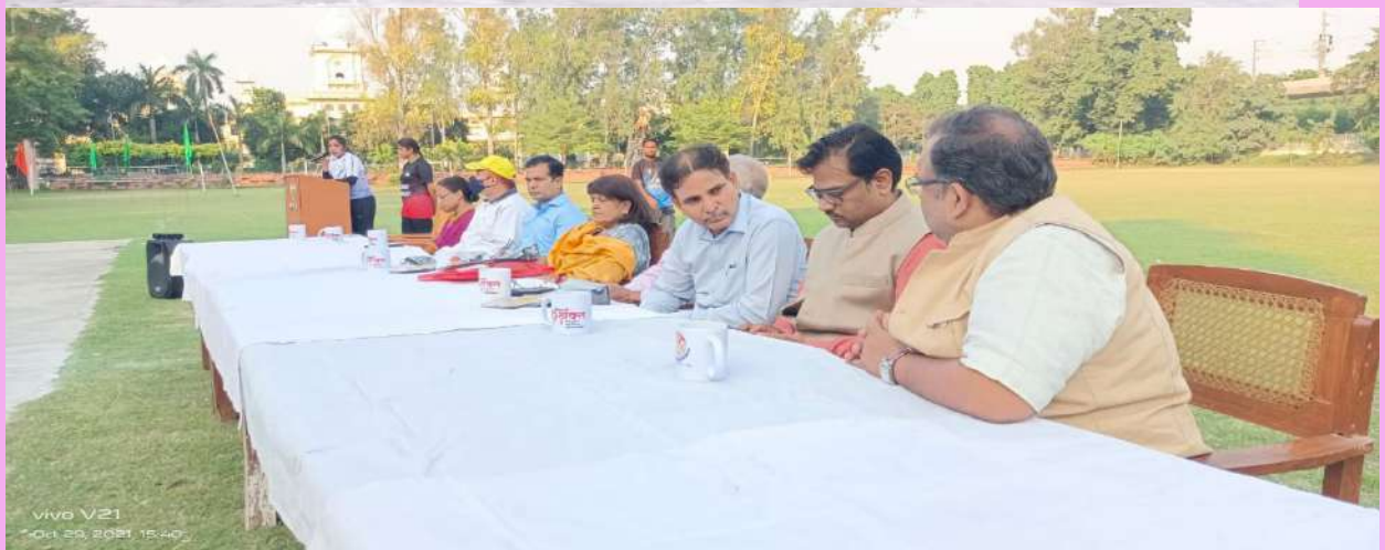
Physical Education: 7 days celebrations