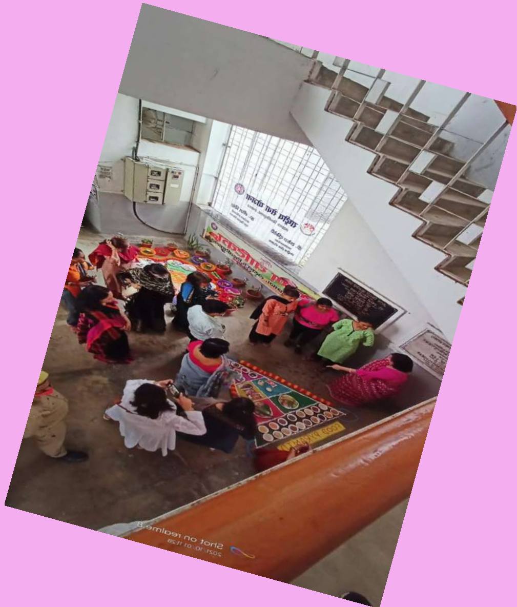
The Tiffin Nutrition Analysis