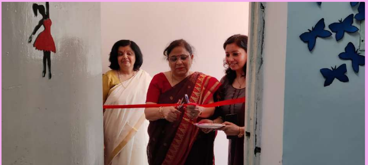
Launch of My Space by Dept of Geography