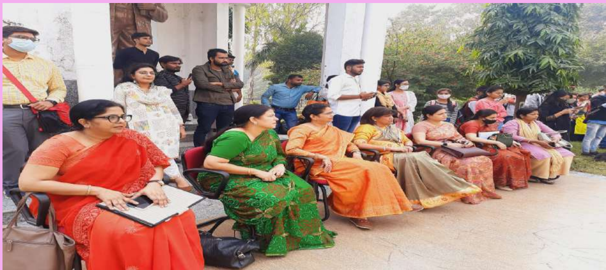
Psychology: Outdoor activities