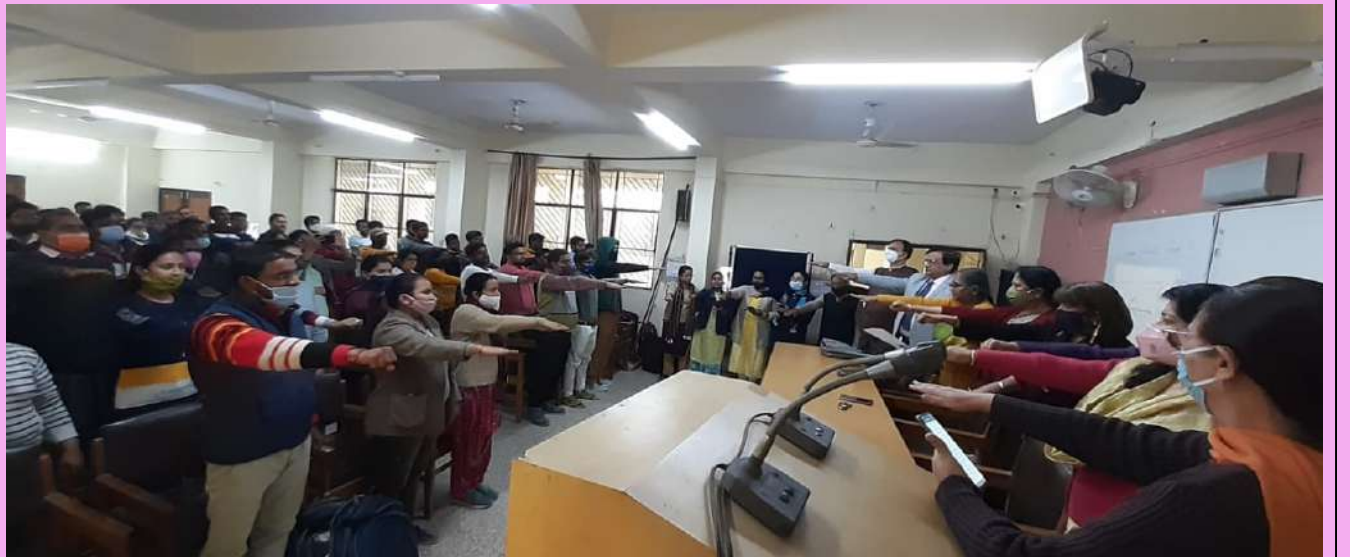
The Oath Ceremony: Education