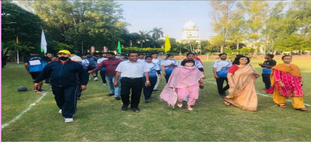
Physical Education; seven days celebrations