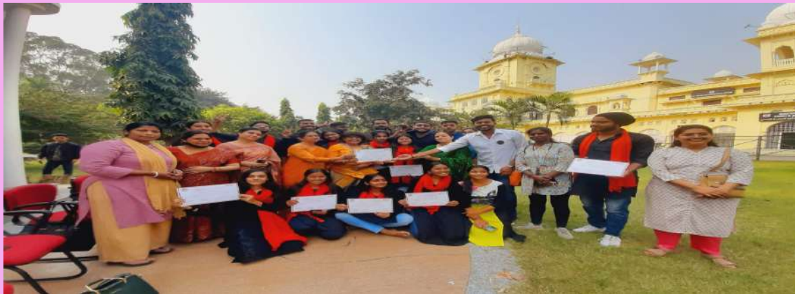
Psychology: the cultural presentations