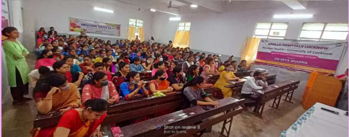
The Nurtion Month celebrations, NSS and Home Sc with The Colleges