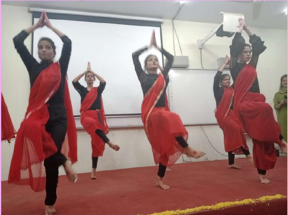
The Shakti by Bus. Administration