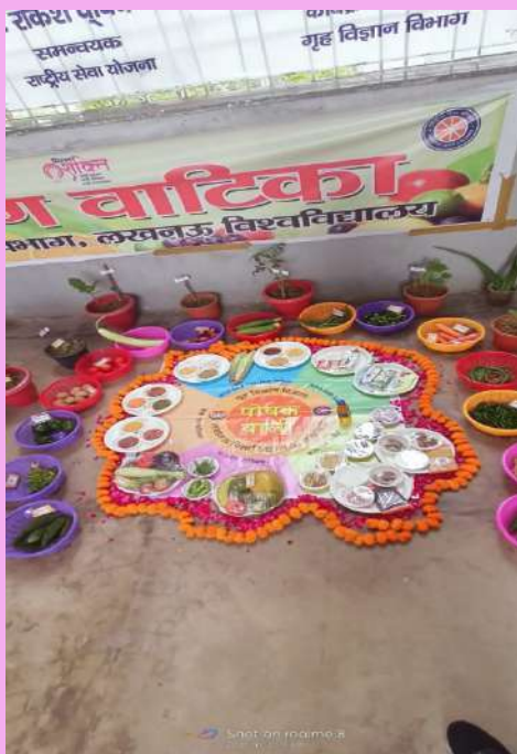
NSS and Home Science