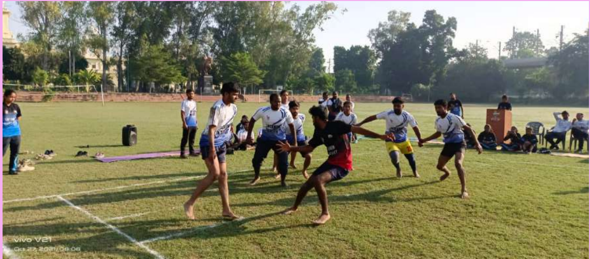
Physical Education: Kabaddi