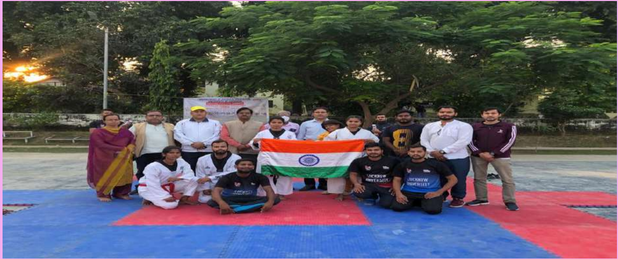
Physical Education- 7 days celebrations