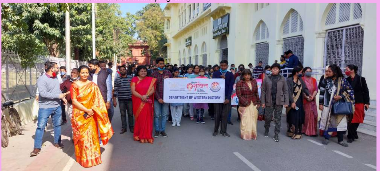
Mega rally : Mission Shakti