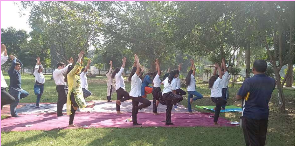
Political Sc: the yoga activity