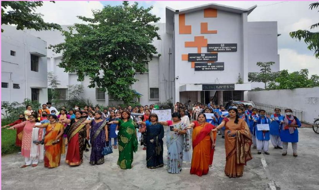
The Mega Oath Ceremony