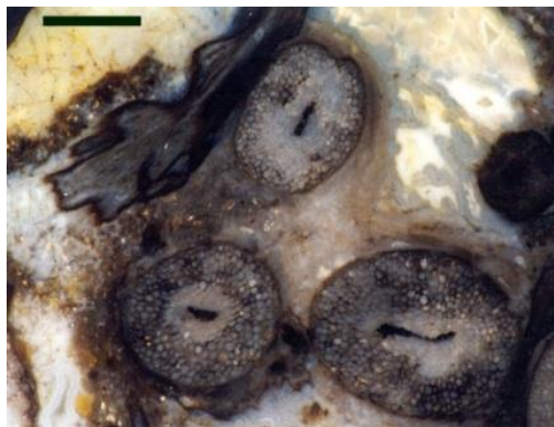
Longitudinal section of the outer cortex and epidermis of an aerial axis of Asteroxylon mackiei showing three non-vascularised scale-like enations or 'leaves' (e) (scale bar = 2mm).

The aerial axes of Asteroxylon exhibit a maximum diameter of 12mm and possess characteristic 5mm long scale-like 'leaves' or enations surrounding each axis (see inset below right). Asteroxylon is perhaps the largest of the known plants from the chert, in life probably attaining a height above ground of about 40cm (it's rhizomes penetrating the substrate to a depth of up to 20cm). Branching is dichotomous and monopodial .