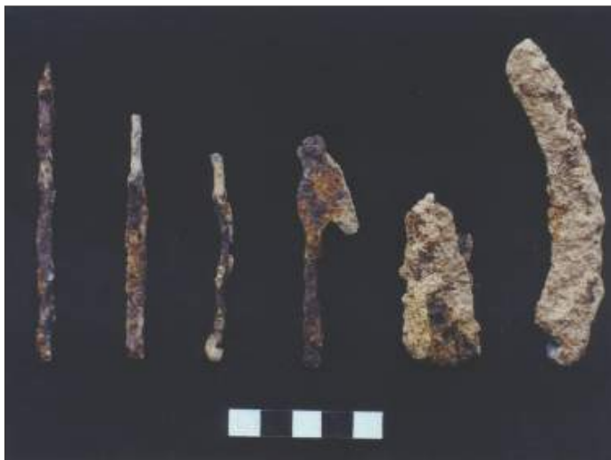
Figure 4. Iron artefacts, from the lower and middle levels of Period II, Malhar, Dist. Chandauli.

The area around Malhar may have been something of a centre of iron production. A small mound, of a kind known locally as lohsan or lohsanwa , about 500m south to the main site of Malhar, which looks like a heap of iron slag, on excavation revealed two damaged clay furnaces, one of them is illustrated here as Figure 6, filled with iron slag along with a few sherds of the red, grey, and black slipped wares, an axe, and tuyeres . Survey revealed several lohsanwa sites near Musakhand village, the site known as Phakkada Baba located within the Musakhand dam, to the north-west of Malhar, on Baba Wali Pahari (Tewari et al. 2000) and near Naugarh kot (Singh et al. 2000: 143). Plans of damaged clay furnaces within heaps of iron slag along with tuyeres stuck with smelted iron, and potsherds of the grey, black slipped, NBP and red wares were found at these sites. The pottery assemblage at Phakkada Baba also included examples of dish or bowl-on-stand and other forms, comparable to those from Malhar Period II, in red ware, and black-and-red ware. This extraordinary concentration of iron-slag heaps on Baba Wali Pahari and Naugarh kot suggest that large-scale iron smelting activities continued at these sites for a long time.