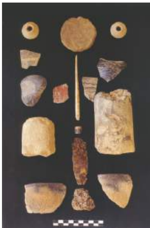
Figure 5. Important cultural components of the early iron bearing deposits, showing corded ware sherds, iron artefact, slag, tuyere, stone and bone artefacts, painted and incised potsherds, stone and terracotta beads. Period II, Malhar, Dist. Chandauli.