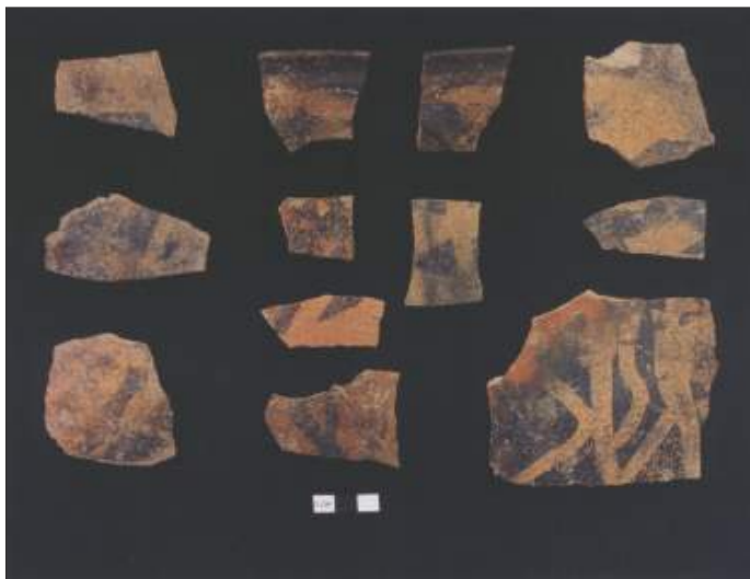
Figure 2. Painted black-and-red ware sherds, from early iron bearing deposits of Period II, Raja Nala-ka-tila, Dist. Sonbhadra.

Since the date for the introduction of iron in the middle and lower Ganga Valley was