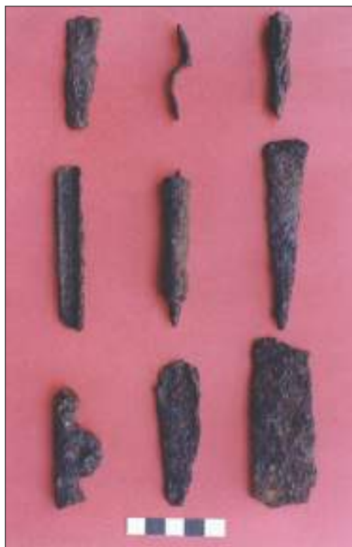
Figure 3. Iron artefacts, from the lower and middle levels of Period II, Raja Nala-ka-tila, Dist. Sonbhadra.