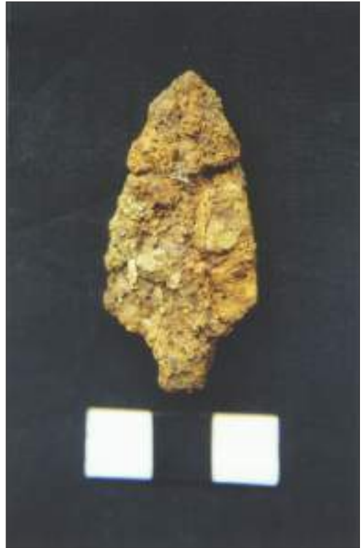
Figure 7. Highly corroded iron arrowhead, Period I, Dadupur, Dist. Lucknow.