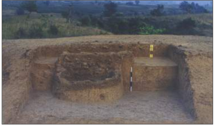
Figure 6. Damaged circular clay furnace, comprising iron slag and tuyeres and other waste materials stuck with its body, exposed at lobsanwa mound, Period II, Malhar, Dist. Chandauli.

shown in Figure 7. Red ware dominates the pottery assemblage of this period, while the