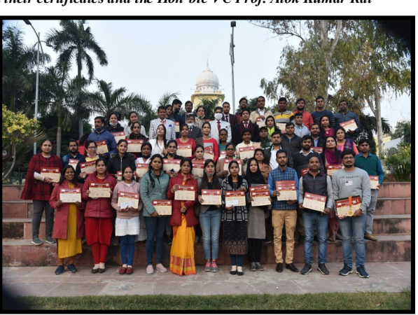
Winners of UDDEEPAN posing with the Hon'ble VC

i) Year 2017-18: to 18 teachers and 40 research scholars ii) Year 2018-19: to 14 teachers and 29 research scholars iii) Year 2019-20: to 20 teachers and 39 research scholars.