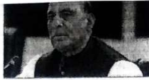
Defence min Rajnath Singh FILE