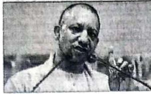
UP CM Yogi Adityanath FILE