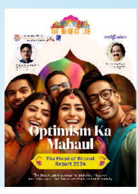
The Mood of Bharat Optimism Ka Mahaul