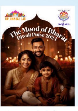
The Mood of Bharat Diwali Pulse 2024