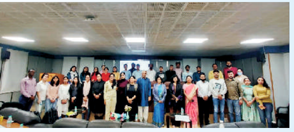
Ashoka University (CSBC) Felicitated Honorable Vice Chancellor.