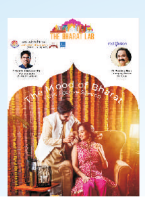
The Mood of Bharat This Festive Season