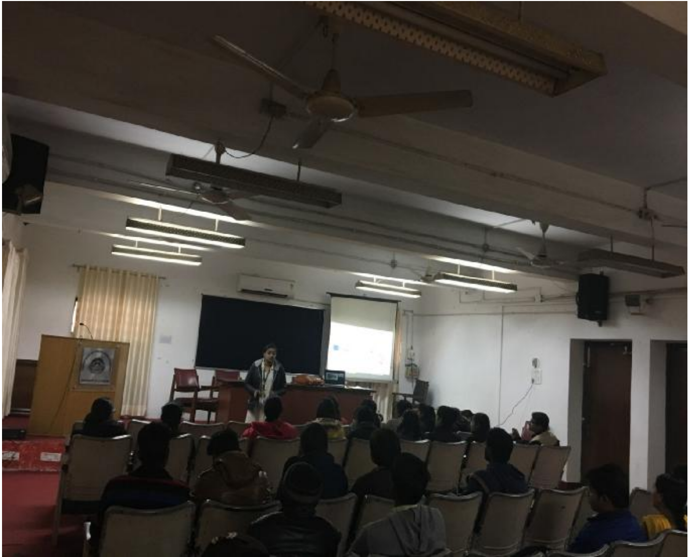
Briefing candidates for interview