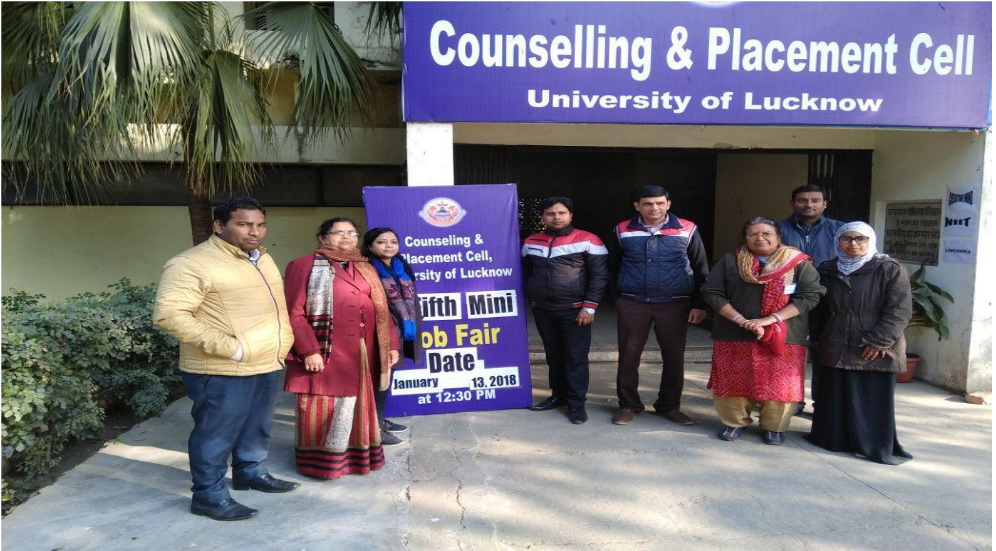
Team CPC with NIIT – preparing for placement drive