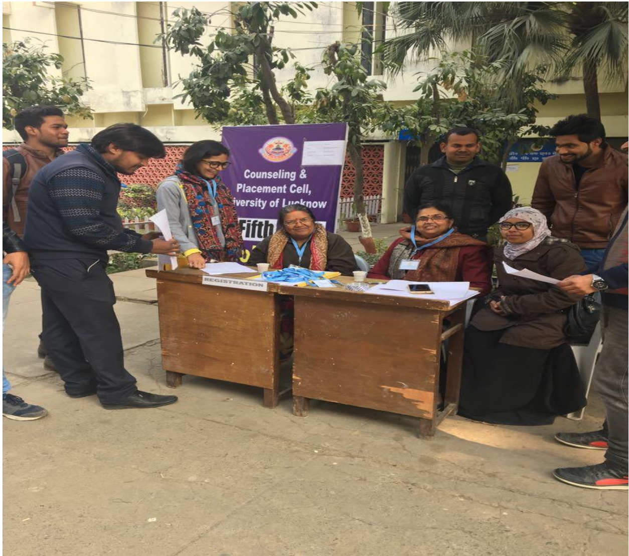
REGISTRATION DESK ALERTED