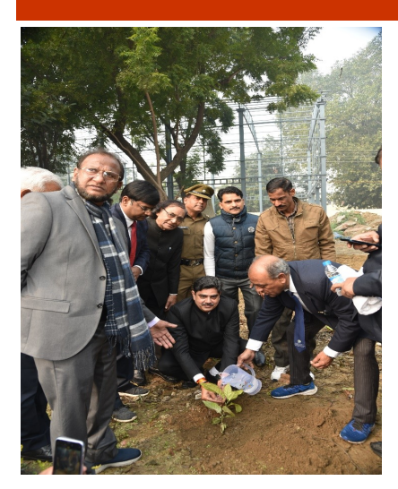
Hon'ble VC planting the first sapling on R-Day

The University creates history plants 36262 saplings on Republic Day